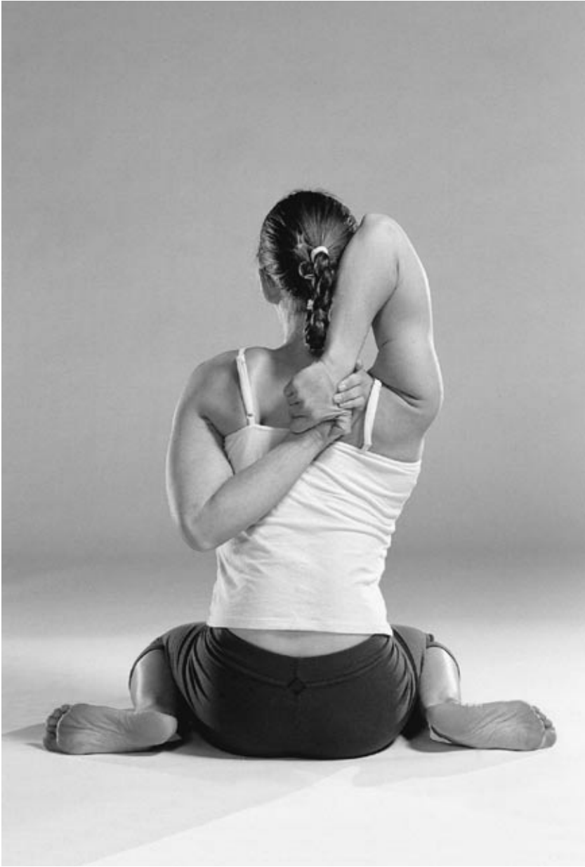
गोमुखासन – Gomukhasana