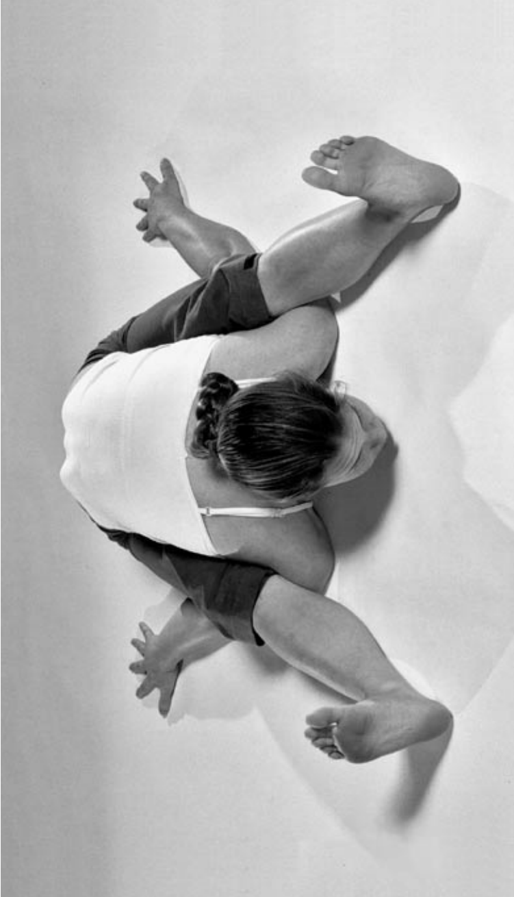
कूर्मसिन् - Kurmasana