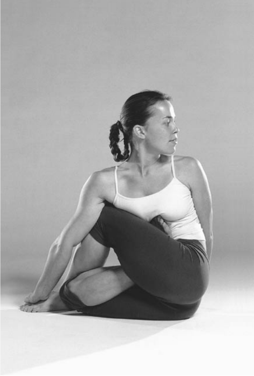
मत्स्येन्द्रासन – Matsyendrasana