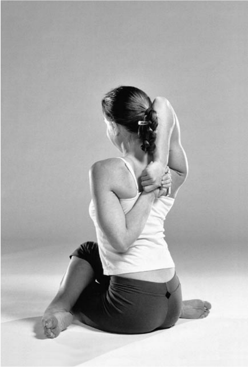
वीरासन – Virasana