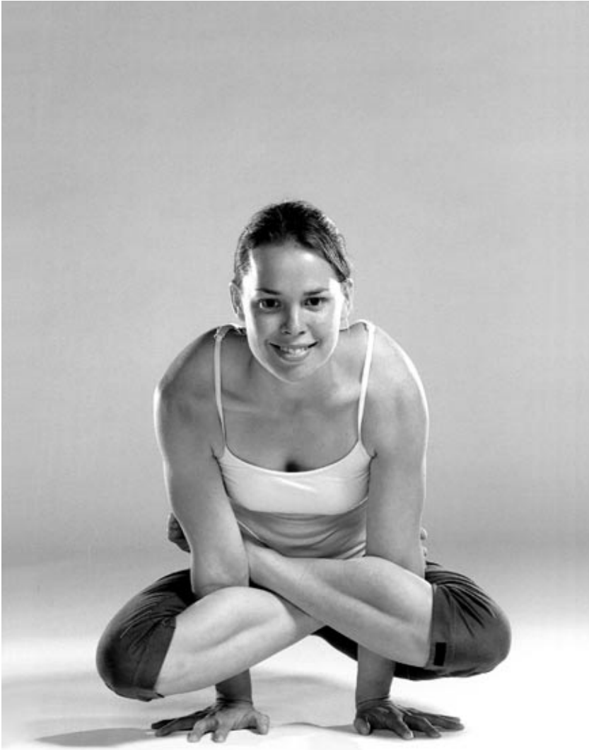
कुक्कुटासन – Kukkutasana